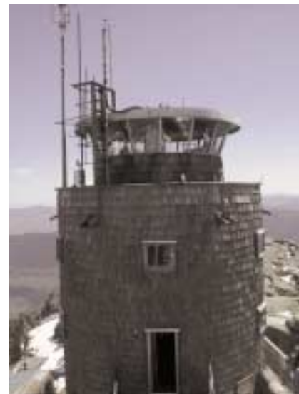
The ASRC weather tower on the summit of Whiteface Mountain houses fine particle sampling instruments.

NYSERDA has incorporated suggestions made by the Science Advisory Board. Program Opportunity Notice 540-00, issued in May 2000, requires the principal investigator to prepare a short paper summarizing the usefulness of the research for policy formulation. To this end, principal investigators are strongly encouraged to collaborate with policy analysts in preparing these papers and use interdisciplinary teams including environmental scientists, social scientists, and public policy analysts.