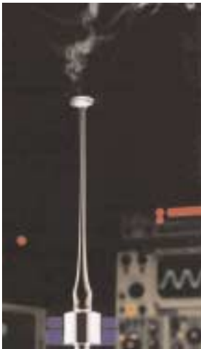
Rupprecht & Patashnick's patented "tapered element oscillating micro-balance" used to take real-time measurements of fine particle mass.

nized experts in atmospheric chemistry, hydrology, ecology, health sciences, statistics, and science-policy integration. The Science Advisory Committee promotes discussion of opportunities for enhanced collaborations among EMEP researchers.