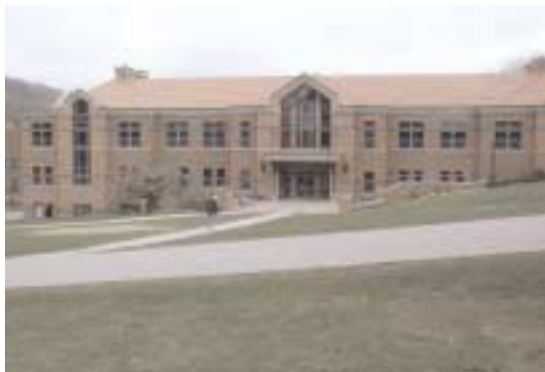
Alfred University's Powell Campus Center.

"Our students in the senior mechanical engineering design project had a real-world type of experience in that we treated them as employees working on a job. We identified goals and objectives and then they had to figure out a schedule to make measurements, when they had to finish, which buildings [instruments] had to be put in, when to collect the data at each of the buildings, and how to remediate problems when they were not getting the data they expected."