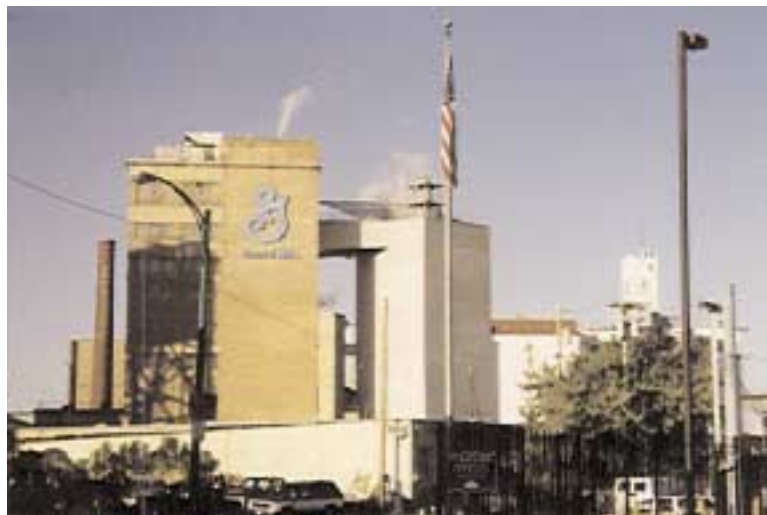
General Mills plant in Buffalo

As a value-added benefit, mechanical engineering students assisted in the implementation of the project and received six credits toward completing their senior mechanical engineering design project, a prerequisite to graduation. Students assisted Sear-Brown technical consultants in the installation of instrumentation, in the downloading and analysis of the data from the equipment, and the development of demand curves for each of the 20 buildings instrumented. They also assisted in conducting a thorough energy audit of each instrumented building. These audits tracked energy use to various devices in each building, including heat pumps, lights, copy machines, and motors.