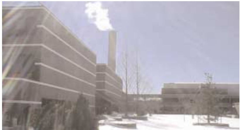
Rockland Community College's Main Utility Plant

Rockland County Community College is located in the Hudson Valley, approximately thirty miles northwest of Manhattan. Since 1990, the college has achieved major energy cost reductions from energy efficiency projects. In 1999, in an effort to identify additional savings opportunities, the College applied for and was approved for funding from NYSERDA's Energy Operations Management program. The funding is enabling the College to work with Strategic Power Energy Services, Inc. to develop a Master Energy Plan that will identify operations strategies for further reducing energy costs. An interim report, released in January 2000, identified a number of opportunities for improving efficiency through the modification of operation and maintenance procedures. For example, the report identified an opportunity for savings from optimizing the dual-fuel capable equipment (able to fuel switch easily between oil and gas depending on current market conditions). When the study is finalized, it is expected to include a full evaluation of the college's energy use, including (1) an assessment of operational and maintenance processes, (2) an identification of energy efficiency measures that need further study prior to acquisition, and (3) identification of opportunities for training personnel on a computerized maintenance management system (CMMS). Estimates of potential cost savings range from 6% to 10% of